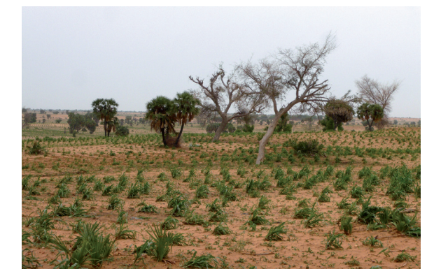
Millet fields in the farming zone

But there is also a social and cultural dimension to the Rural Code, another important specificity. It claims that land is a unique resource, and that it should be considered a national collective heritage. However, while promoting an open and participatory approach that includes women, youth and minorities, the Rural Code does not frankly challenge customary law, still very influential in Niger : on the contrary, traditional chefferies have an important role in the implementation process of the Rural Code. In this process, positive law intends to emphasize positive aspects of customary law while counterbalancing its traditional supremacy.